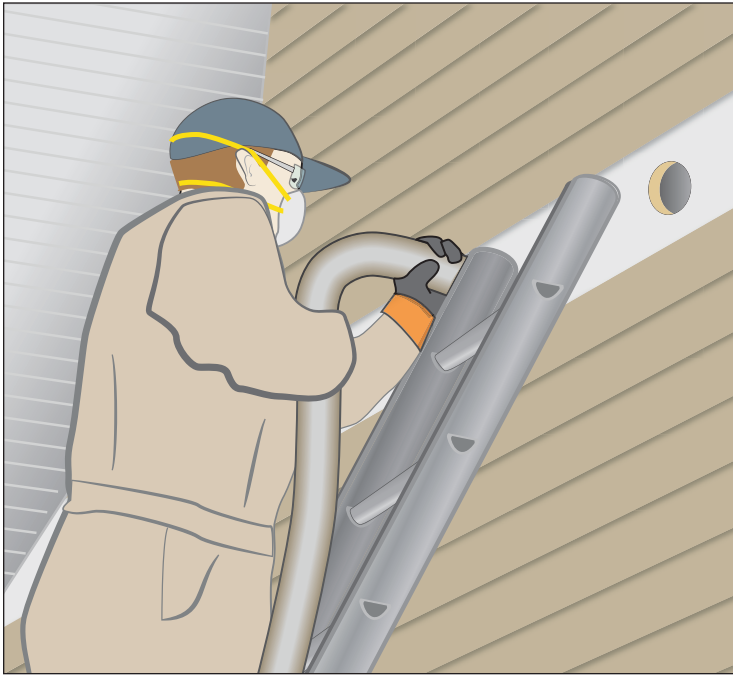
Siding removed and holes drilled into sheathing.