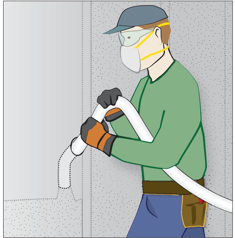
Holes drilled through interior walls allow insulation to be blown into wall cavities