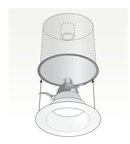
An LED retrofit kit installs in older recessed fixtures. Air sealing at this important leak point is an added benefit beyond the savings of the LED.

Recessed can lights present a large opportunity for improvement in most homes because they typically contribute a large percentage of the lighting electricity load and they are also primary areas for air leakage from the living space into the attic or into spaces between floors. LED retrofit kits are available that address both of these issues. By replacing both the existing bulb and trim with an integrated LED light and trim that is airtight, the fixture will become energy efficient, dimmable and will no longer be leaky.